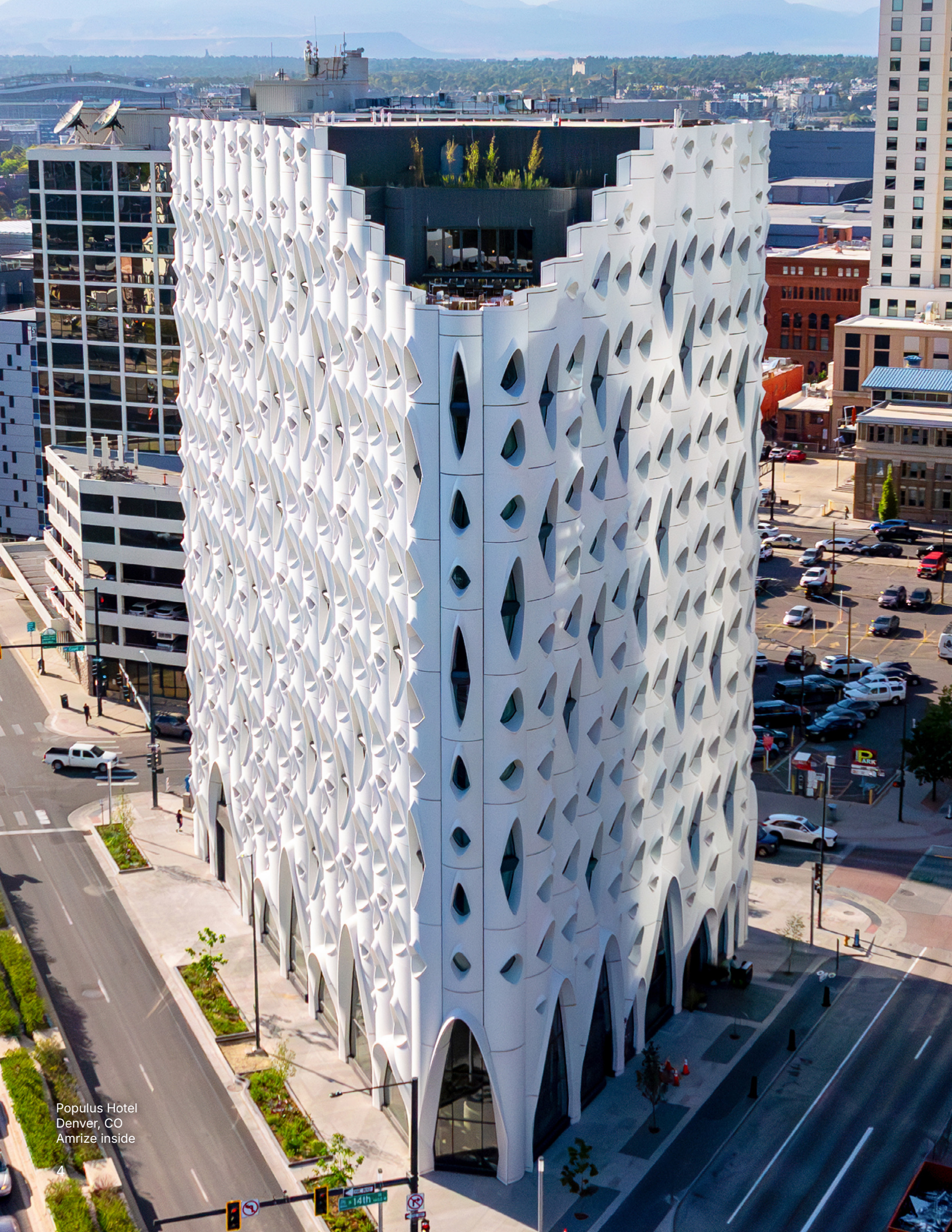
Populus Hotel Denver, CO Amrize inside