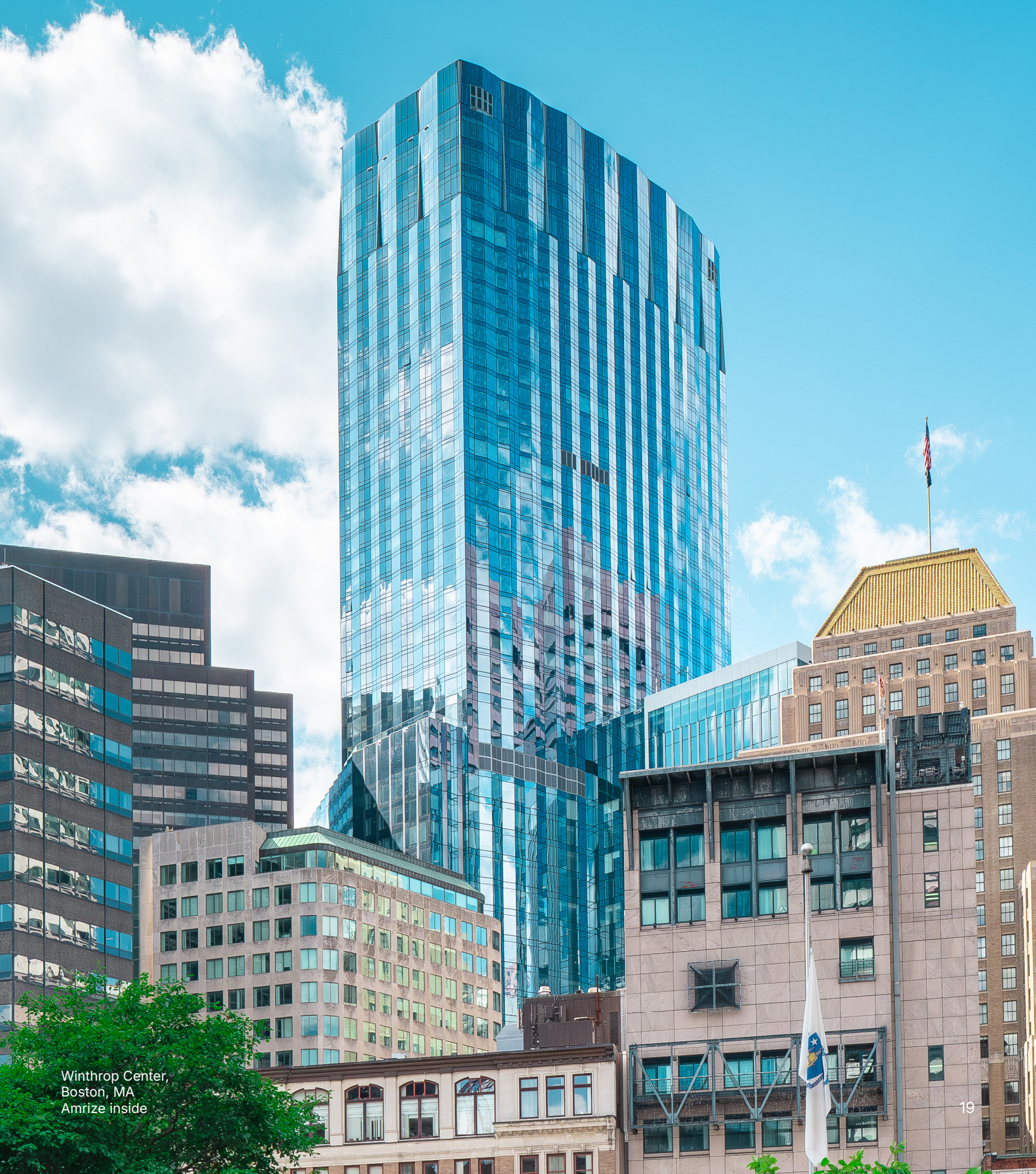
Winthrop Center, Boston, MA Amrize inside