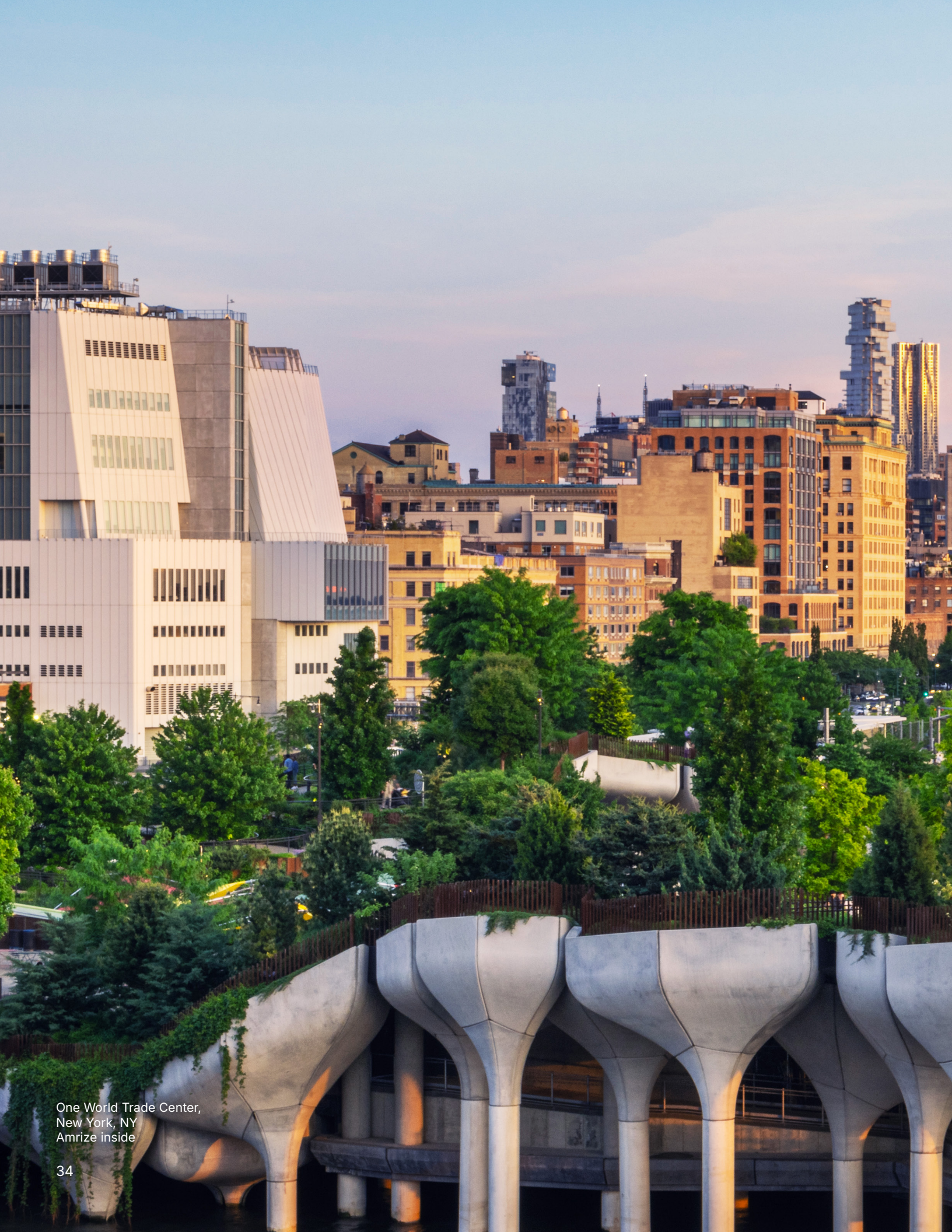
One World Trade Center, New York, NY Amrize inside