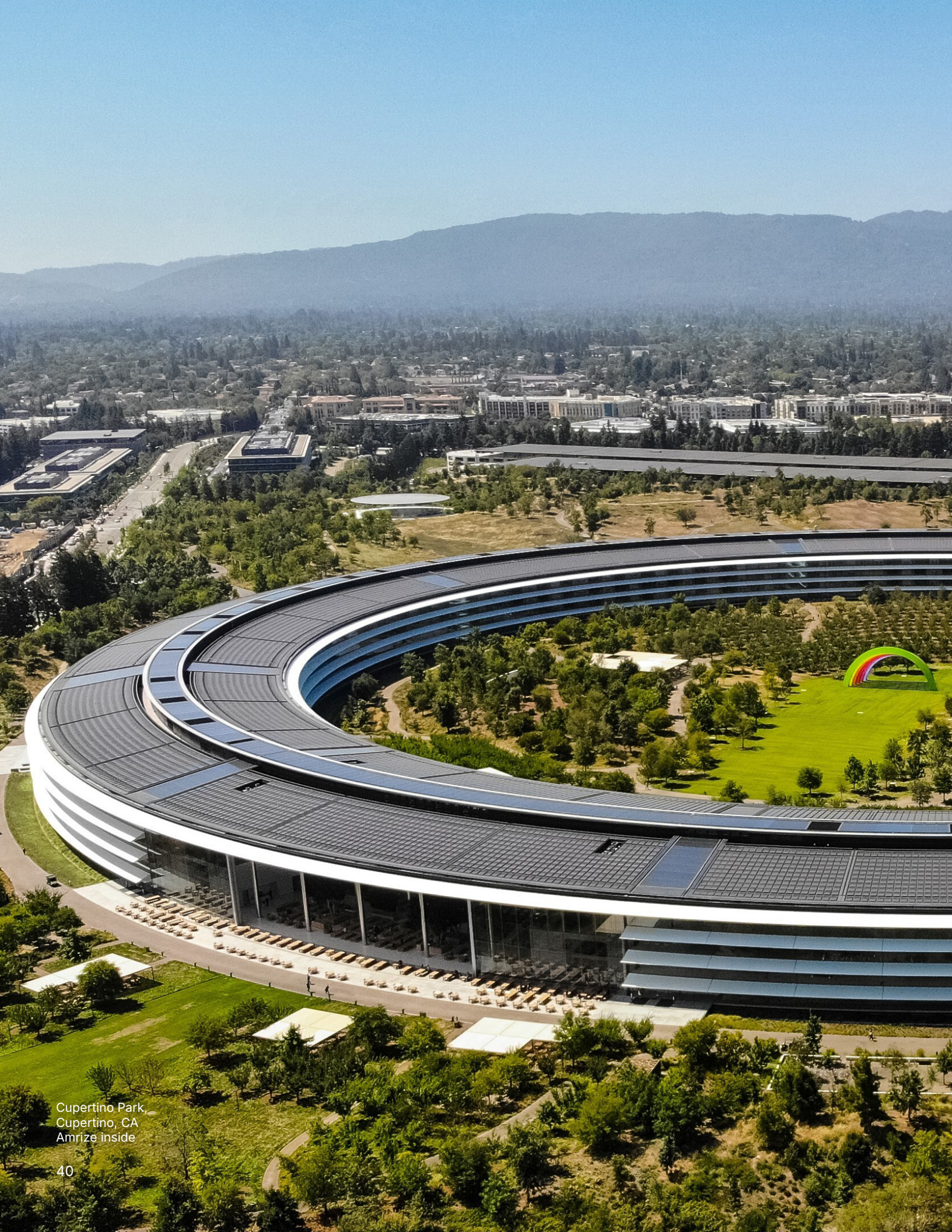
Cupertino Park, Cupertino, CA Amrize inside