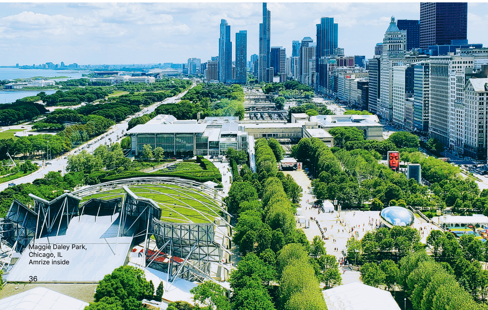
Maggie Daley Park, Chicago, IL Amrize inside